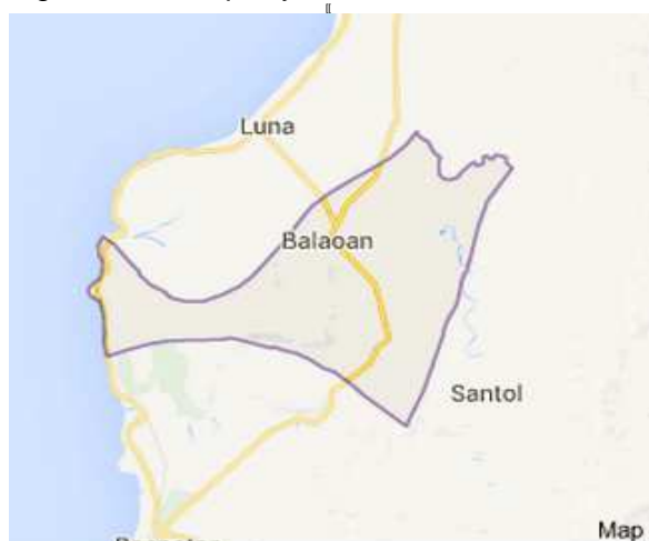
Figure 1: Municipality of Balaoan